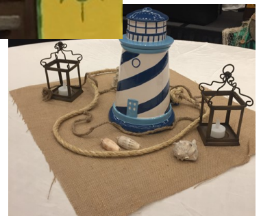
One of the table decorations for Fall Council.