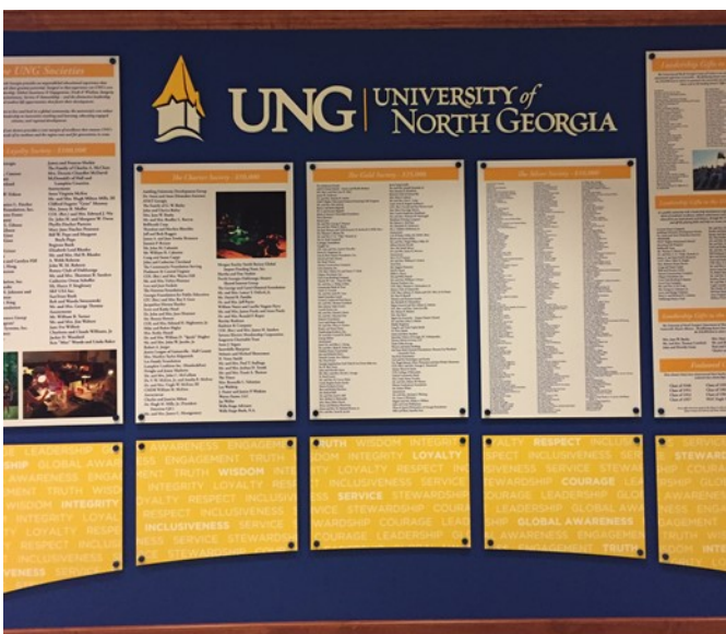
Honor Wall at University of North Georgia