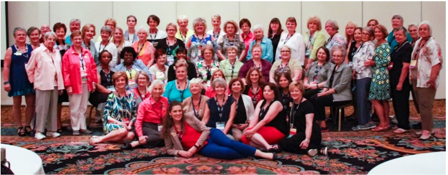
Georgia Pilots at PI Convention.